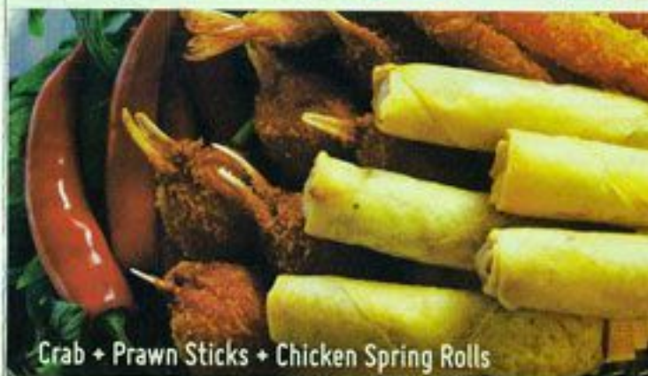
Crab + Prawn Sticks + Chicken Spring Rolls