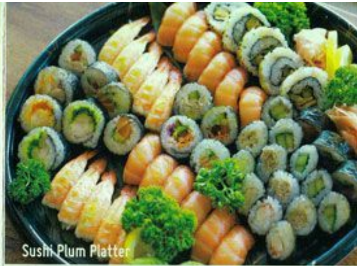
Sushi Plum Platter